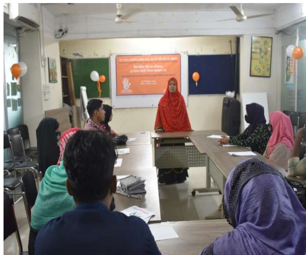
GBV case sharing by participants