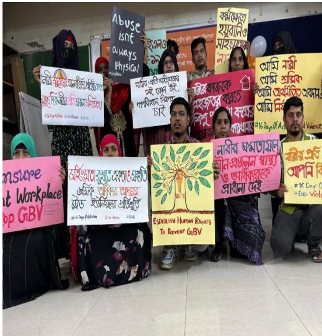
Human Chain Demonstration