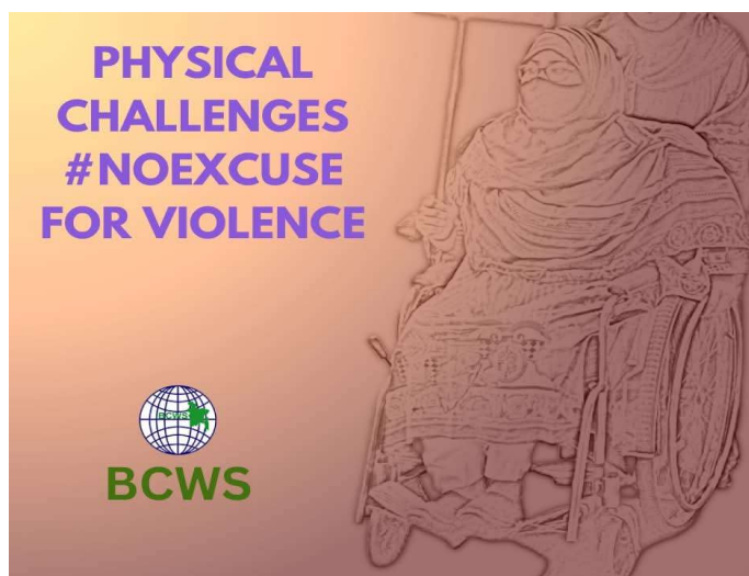
Social media campaign: Poster highlighting prevent violence and stand together with physical challenges