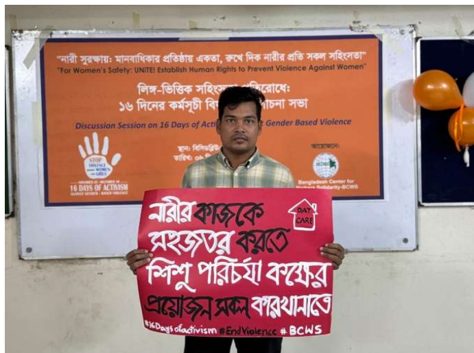
Protest of RMG workers to address violence against women and girls