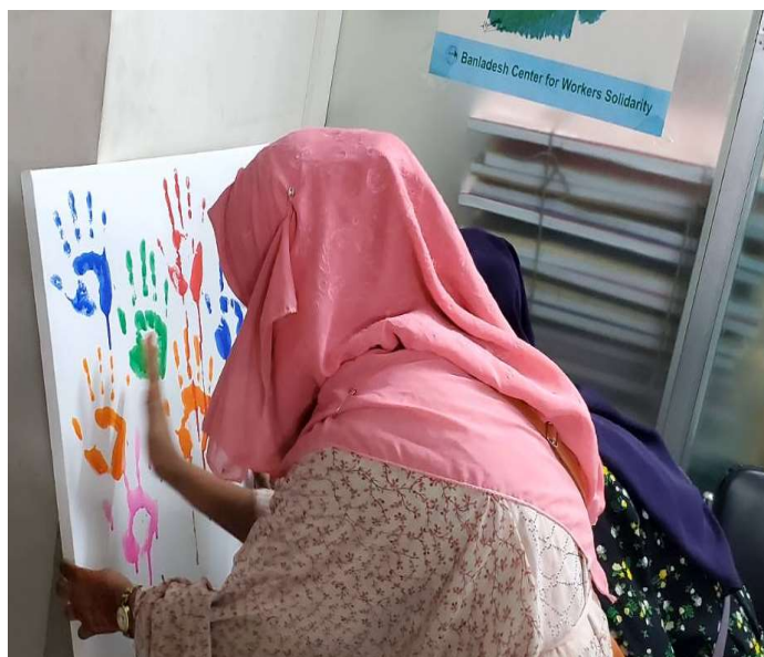
Hand print of workers reflecting zero tolerance of GBV