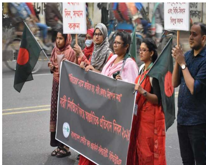
A torch procession leading to Mishuk-Munir Chattar