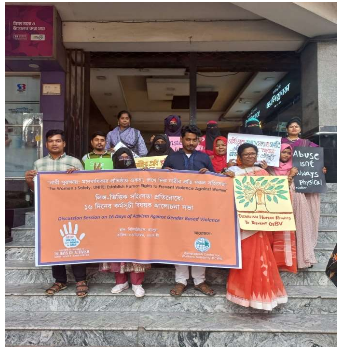
Human Chain Demonstration