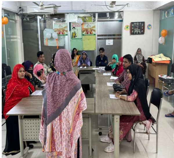
Opening remarks of 16 Days of Activism by the Project Coordinator of BCWS