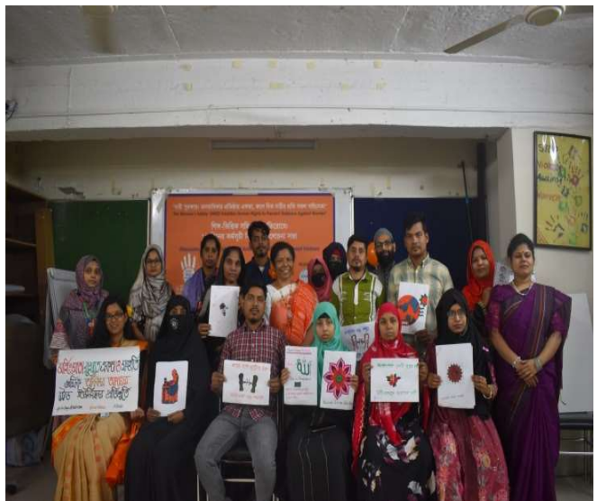
Human Chain Demonstration