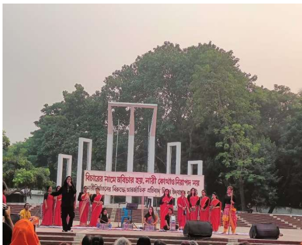
Dance presentation and poet recitation