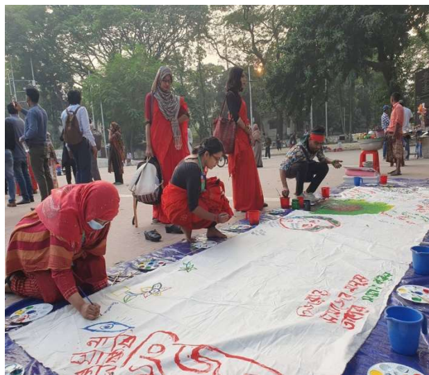
Performance art by Jibon Unnayan Songstha