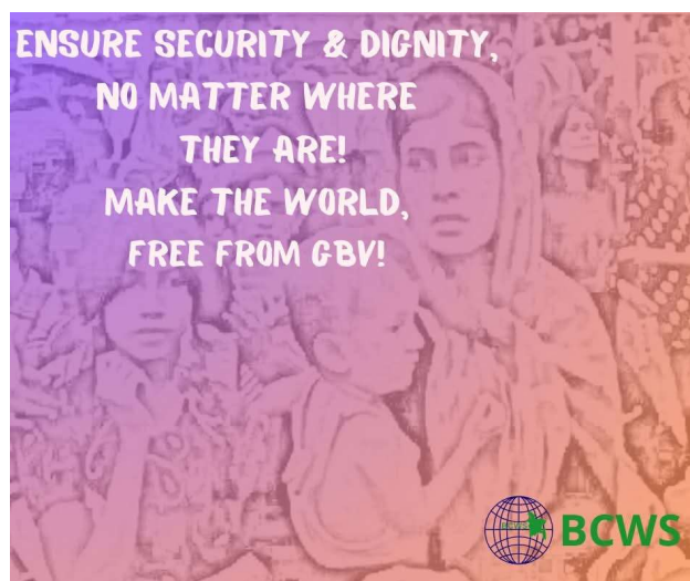
Social media campaign: Poster highlighting make the world free from violence and ensure security and dignity for refugees