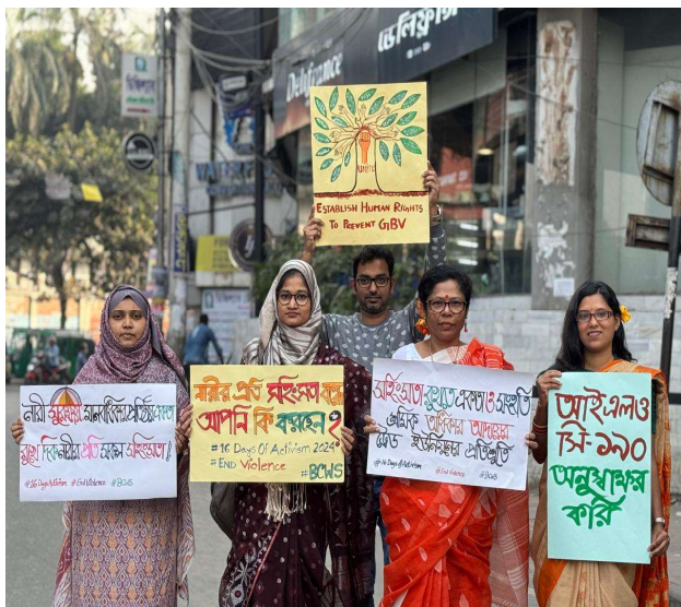
Human Chain Demonstration