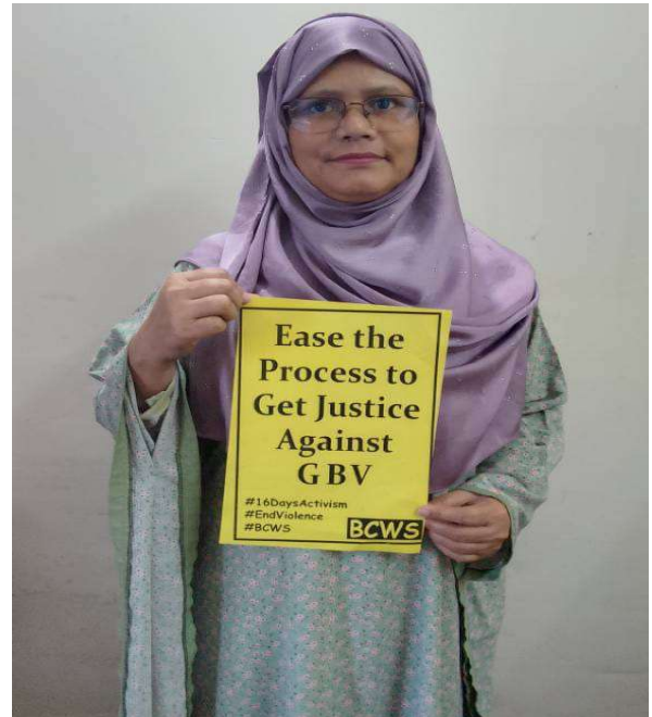
Worker Leaders photo campaign at Gazipur to address violence against women and girls