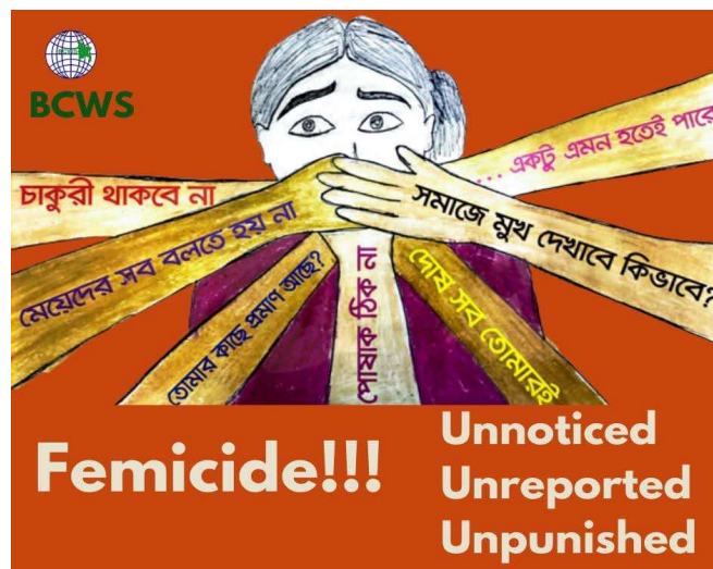
Social media campaign: Poster highlighting stand together against femicide