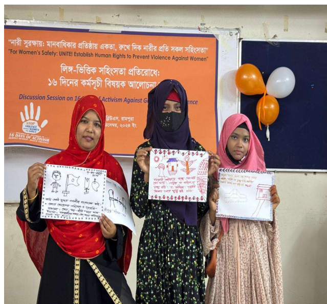
GBV Protest through Art by RMG workers