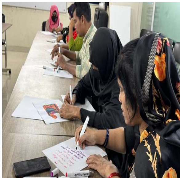
GBV Protest through Art by RMG workers