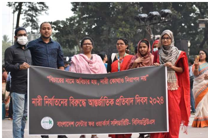
A glimpse of BCWS program Team attending International protest committee against violence against women