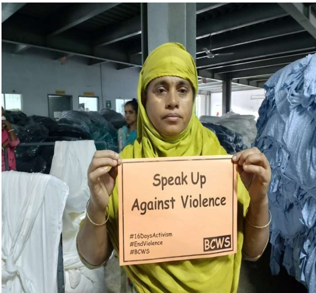
Worker Leaders photo campaign at Ashulia to address violence against women and girls