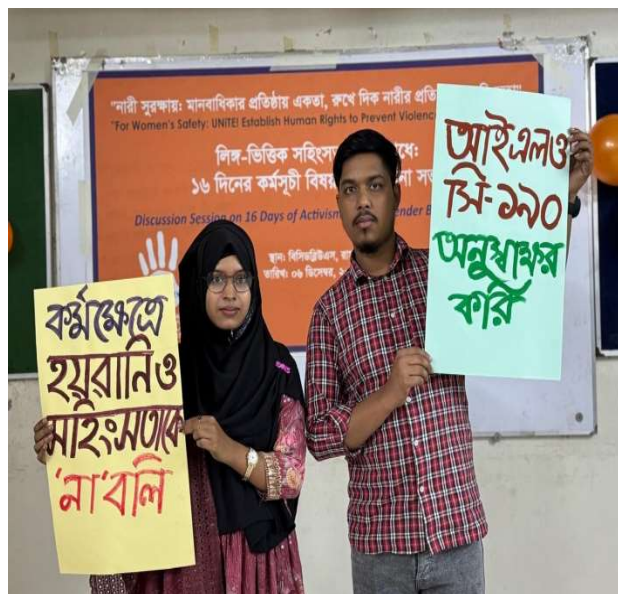
Protest of RMG workers to address violence against women and girls