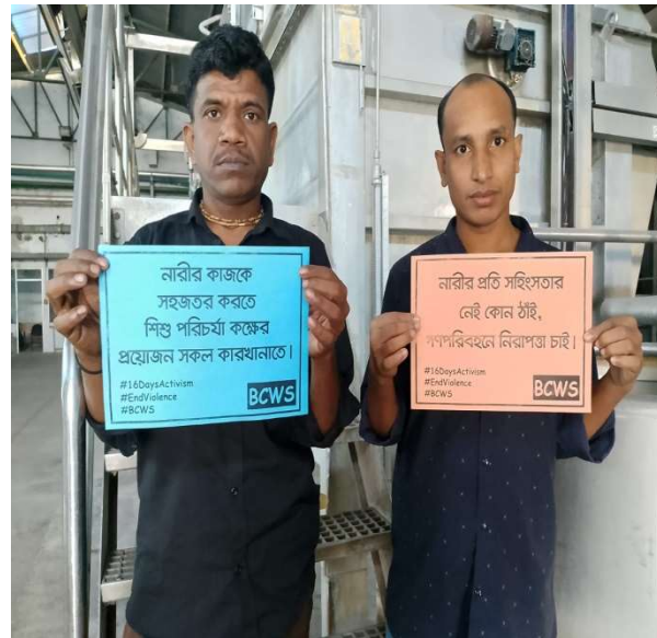
Worker Leaders photo campaign at Ashulia to address violence against women and girls